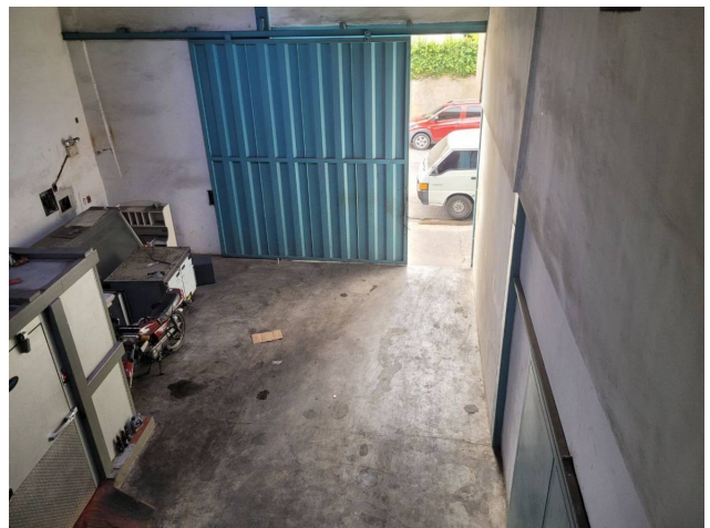
Avenida Centurion 136, Local N° 1, Urb Tricentenaria, Piso 1, Barcelona, Anzoategui, Simón Bolívar, Barcelona, Anzoategui