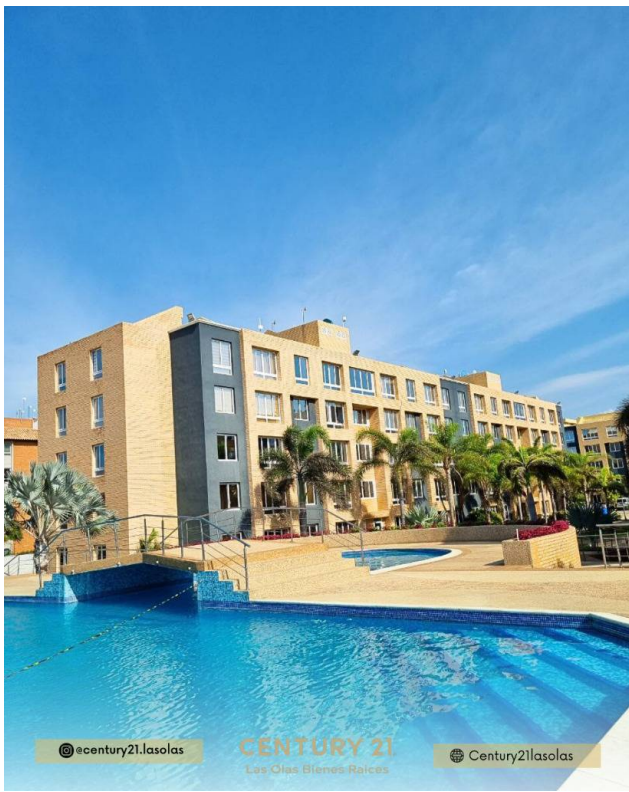
@century21.lasolas CENTURY 21 Las Olas Bienes Raíces Century21lasolas