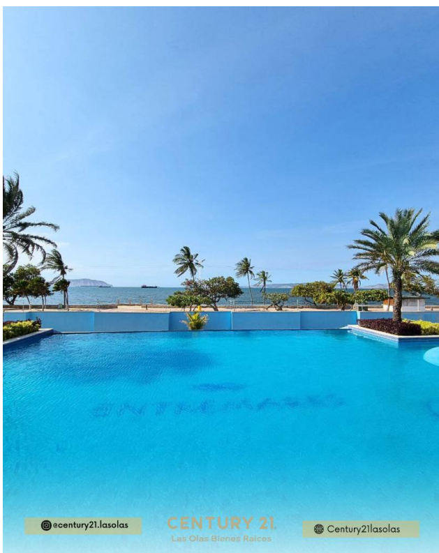
@century21.lasolas CENTURY 21 Las Olas Bienes Raíces Century21lasolas