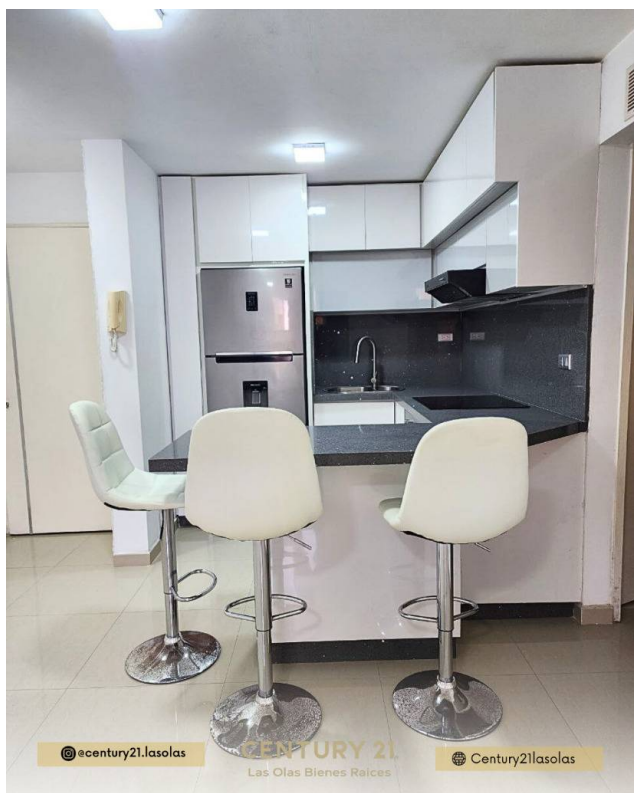
@century21.lasolas CENTURY 21 Las Olas Bienes Raíces Century21lasolas