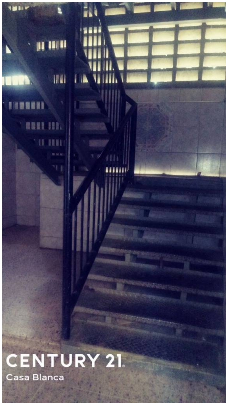
CENTURY 21 Casa Blanca