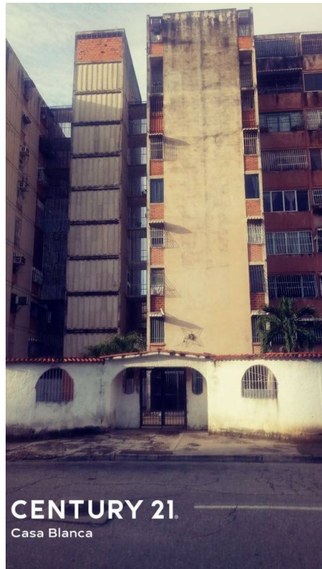
CENTURY 21 Casa Blanca