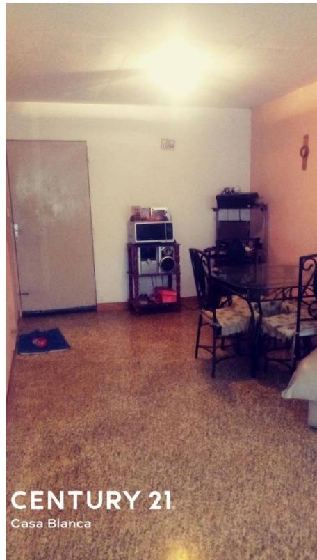
CENTURY 21 Casa Blanca