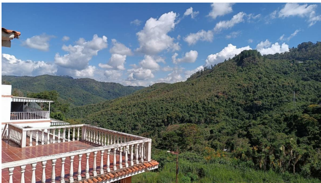
Avenida Los Salías, Centro Comercial Don Blas Oficina N°3, Nivel 1, Los Salías, San Antonio de los Altos,